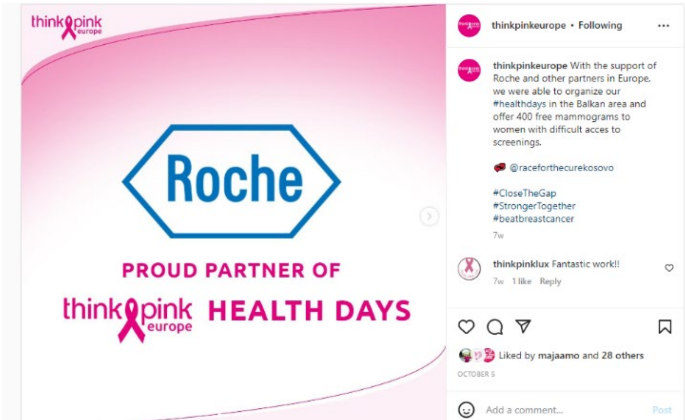
Visibility on Think Pink Europe Instagram page